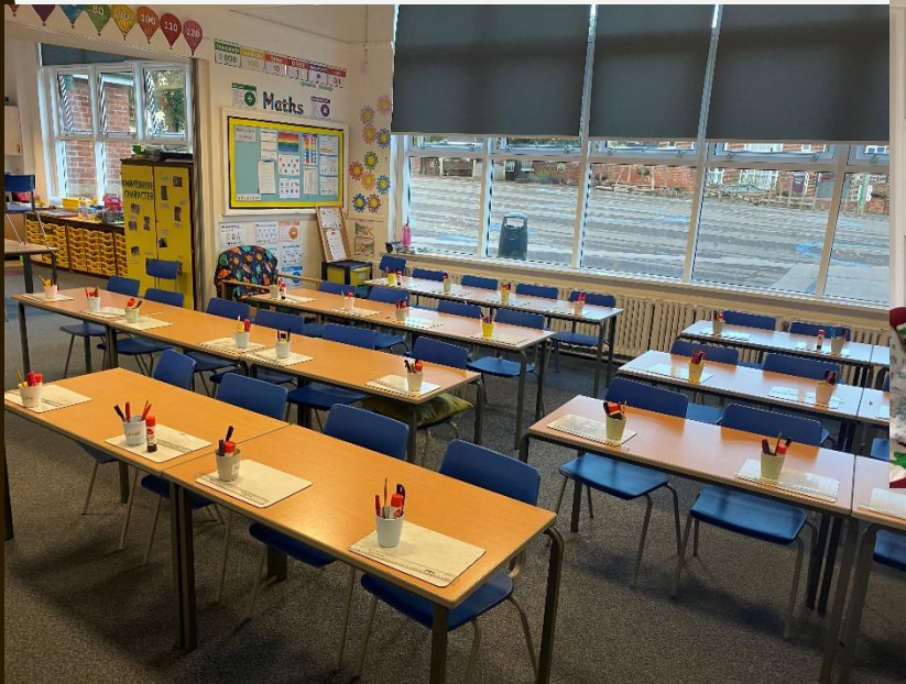
Our 3G Classroom