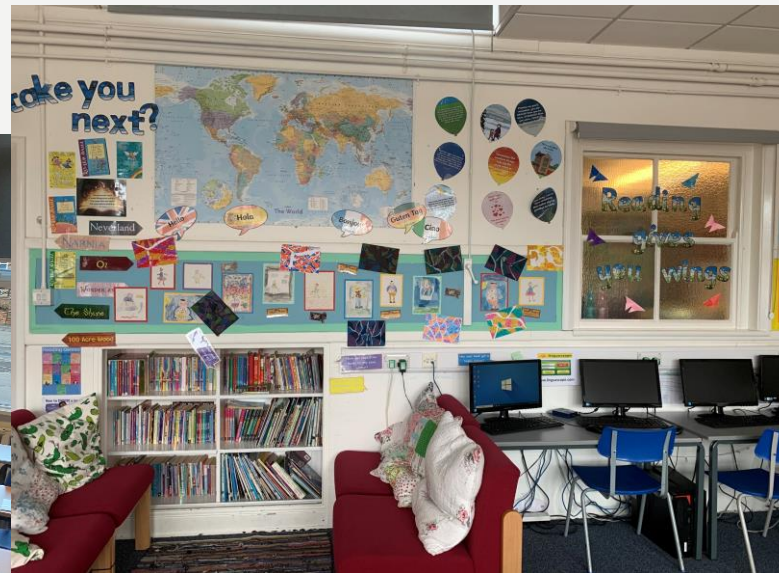
Our 3H Classroom